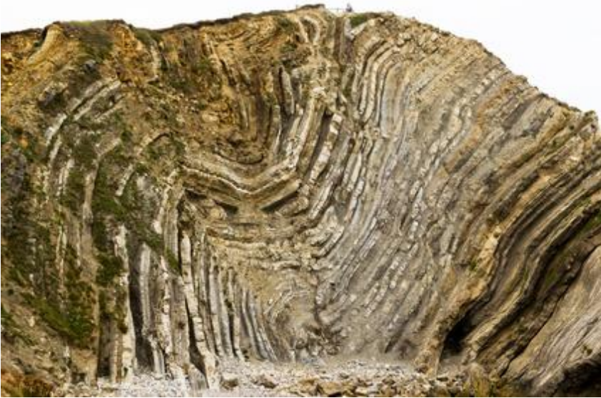
Lulworth cove, Dorset, England

Walt Brown comments: “We have all seen thinly layered rocks that have been folded like a doubled-over phone book. Sometimes these bent rocks are small enough to hold in one’s hand. Other folded rocks are miles on an edge. How does brittle rock, that shows no evidence of heating or cracking, bend into more or less regular folds? Rocks are strong in compression but weak in tension. Consequently, the convex outer surface, which is under tension, should easily fracture. But they haven’t! Bent rocks, which are found all over the earth, often look as if they were squeezed when they had the consistency of putty. Is it possible that the pliable sediments that initially formed these rocks were squeezed soon after the sediments were laid down, but before they had chemically hardened? If so, what squeezed them?” 1