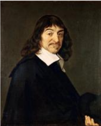
Rene Descartes

Stensen’s work brought him in contact with some of the distinguished men of the seventeenth century, all of whom learned to appreciate his breadth of intelligence and acuity of judgment. We have already mentioned his epistolary relation with Spinoza, and have said something about the controversy with Leibnitz, into which, in spite of his disinclination to controversy generally, he was drawn by the circumstances of the time and the solicitation of friends. Another great thinker of the century with whom he was brought into intimate