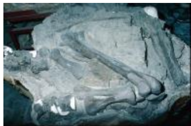
Fossilised animal bones

The same principles he applied to mussel shells, Stensen considered must have their application also to all other portions of animal bodies, teeth, bones, whole skeletons, and even more perishable animal materials that might be found buried in the earth's strata: His treatment of the question of the remains of plants was quite as satisfactory as that of the animals. He