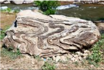
Folded layers in rock

With regard to the composition of the various strata of the earth, the father of geology considered that if in a layer of rock all the portions are of the same kind there is no reason to deny that such a layer came into existence at the time of creation, when the whole surface of the earth was covered with fluid. If, however, in any one stratum portions of another stratum are found, or if the remains of plants or animals occur, there is no doubt that such a stratum had not its origin at the time of creation, but came into existence later. 3