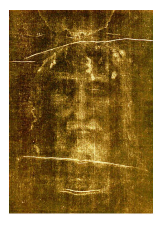
"Come to Me, all you who are weary and heavy laden, and I will give you rest" (Matthew 11:28).